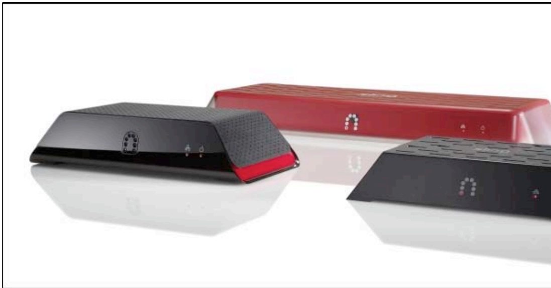
Figure 1. Slingboxes connect to a television set or cable box/satellite and then transmit the television signal to the Internet. Other computers or mobile devices that have been granted access can then retrieve the television programming wirelessly.